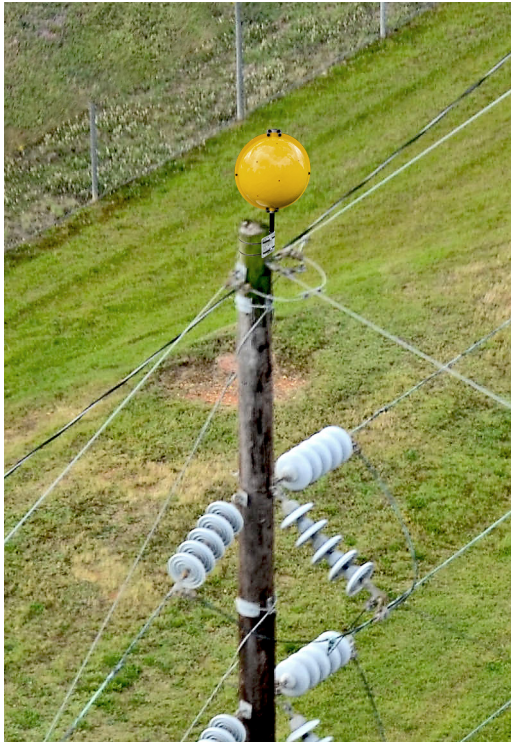
Vertical CrossOver Marker

A system of proven SpanGuard™ markers warns low flying pilots and drone operators of higher power lines crossing their flight path.