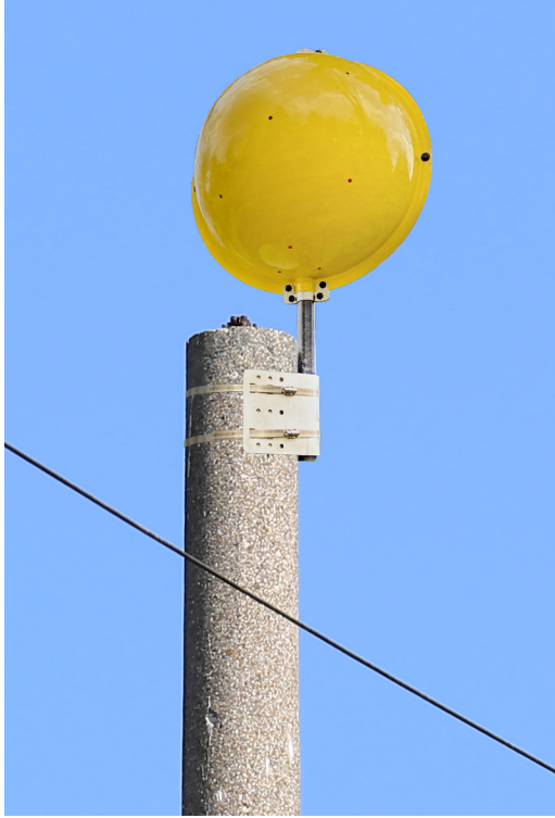
Vertical CrossOver Marker