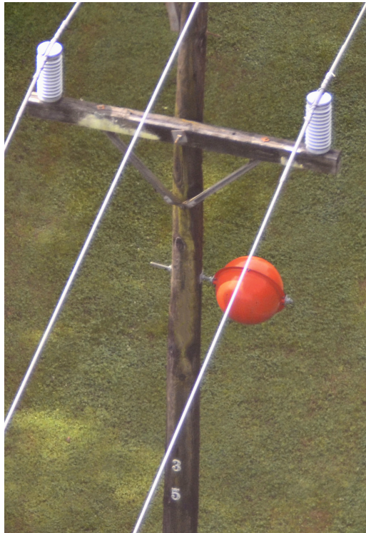
Horizontal CrossOver Marker