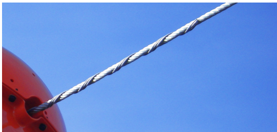
Spiral preform attachment