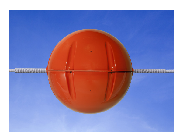
PRM-36 ABS Power Line Marker installed over complete set of armor rods