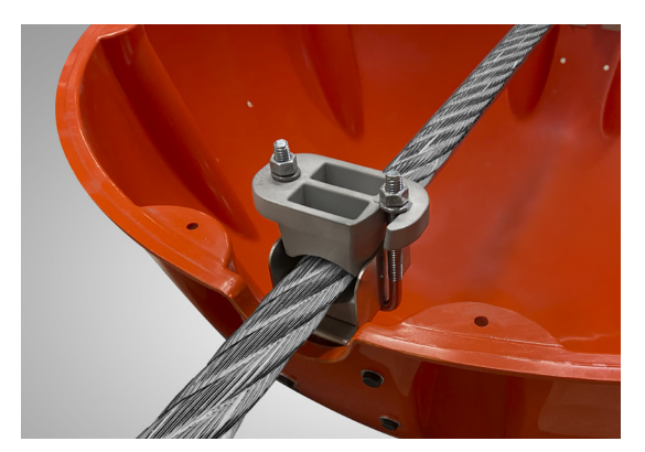
Universal clamp grips line securely (armor rods not shown)