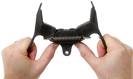
Opening a SnapFast clamp before installation

Highly visible QuikMark markers effectively prevent costly line damage and outages caused by collisions with tall equipment. These economical markers also work on higher lines at heliports, river crossings, and other high traffic areas.