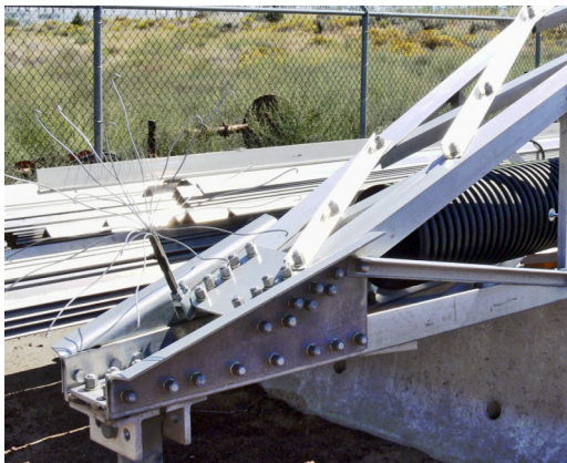
RaptorWire mounts directly to most tower structures (and can also be used to fill most interior spaces)

The splayed wires of RaptorWire provide an effective and reliable method of discouraging birds from nesting, roosting, and perching above critical locations on towers, poles, and substations.