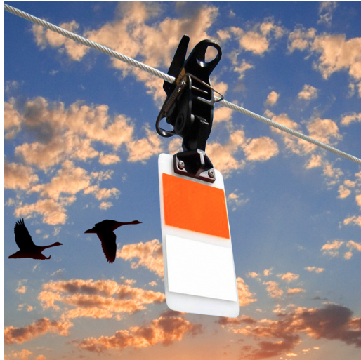
FireFly HW bird diverter