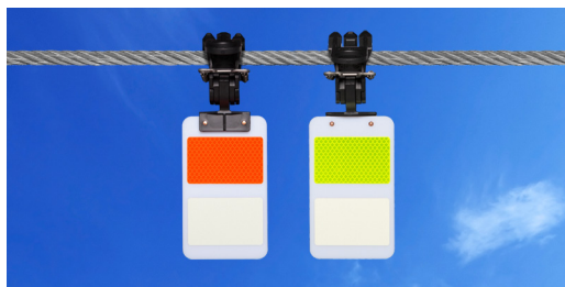
FireFly HW front and back