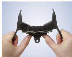
Opening the SnapFast clamp