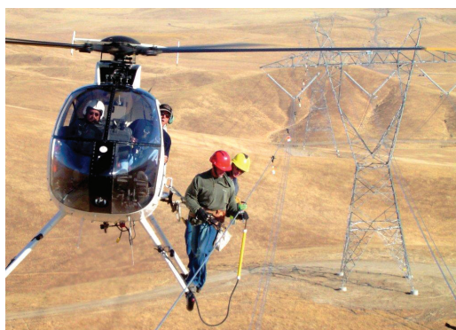
BirdMark can be installed by helicopter

Recommended by the U.S. Fish and Wildlife Service, patented FireFly bird diverters have been shown in independent studies to be the most effective bird diverters in preventing bird strikes on power lines.