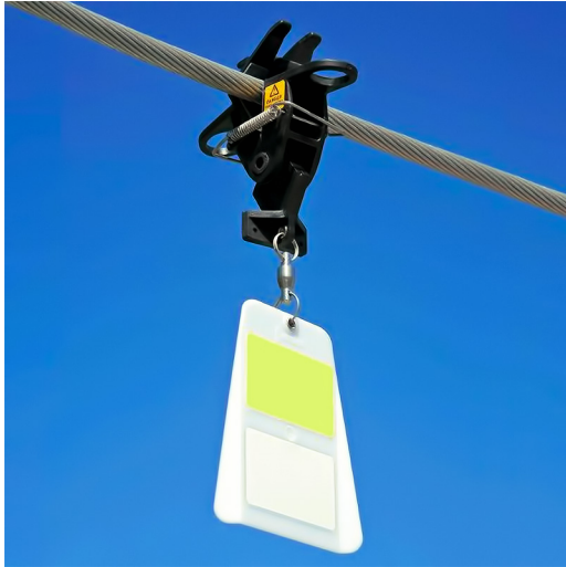
FireFly FF bird diverter