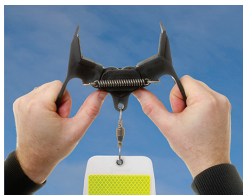
Opening the SnapFast clamp