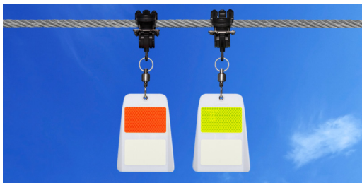
FireFly FF front and back