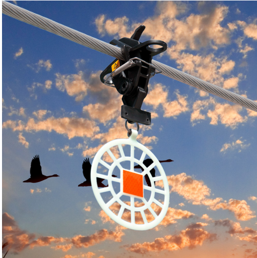
BirdMark bird diverter

Recommended by the U.S. Fish and Wildlife Service, budget-friendly BirdMark bird diverters are comparable to our highly effective FireFly® bird diverters in preventing bird strikes on power lines.