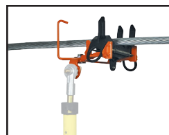
Push to snap closed (tool sold separately)