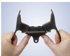
Opening the SnapFast clamp