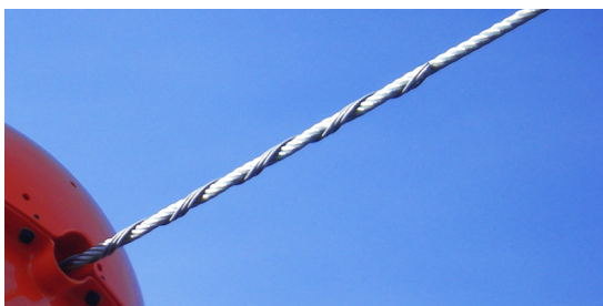
Spiral preform attachment

This is the power line marker that has set the standard for decades! Many of our original SpanGuard markers from the early 1960s remain in service today, long after competing products have failed.