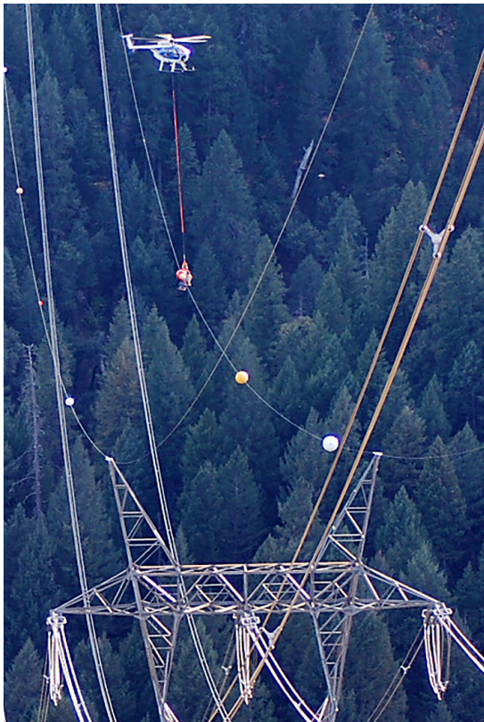
Orange-yellow-white marker sequence