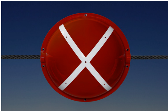
SpanBrite nighttime option